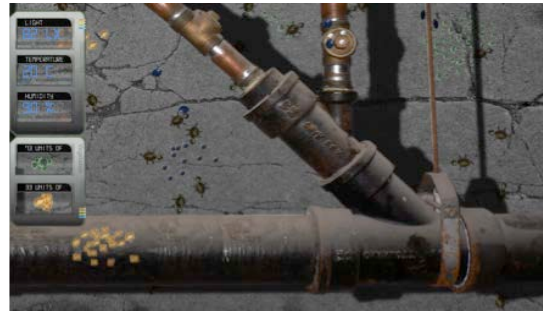
Figure 1. "WallScope" view of a WallCology

Student activity within the unit involves a combination of structured observation, question and hypothesis formulation, experimental manipulation and hypothesis testing, and whole class and small group discussion, all within the context of a technology tool suite that allows students and teachers to contribute to, and draw from, an emerging community knowledge base. Students record observations, utilize the modeling tool, and synthesize contributions to the knowledge base using tablet computers; teachers orchestrate discussions using a SmartBoard interface that gives them access the knowledge base and scaffolds themed discussions aligned with unit milestones.