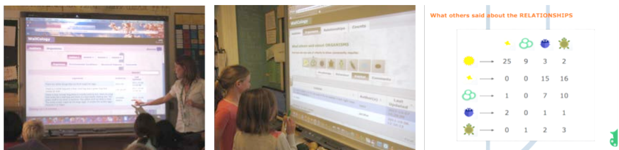
Figure 3. Aggregate representations of community knowledge. Text-based data tables for learning activities 1 and 2, and pair-wise matrices depicting tallies of relational statements, for learning activity 4.

Method. Our designs were informed by the Knowledge Community and Inquiry (KCI) framework, which seeks to integrate elements of community knowledge construction with scaffolded inquiry (Slotta, 2007). We designed a tablet application to facilitate four learning activities within the WallCology unit: recording observations of (1) the organisms and (2) habitats of the ecosystem, and constructing representations of (3) life cycles and (4) food webs (Fig. 3).