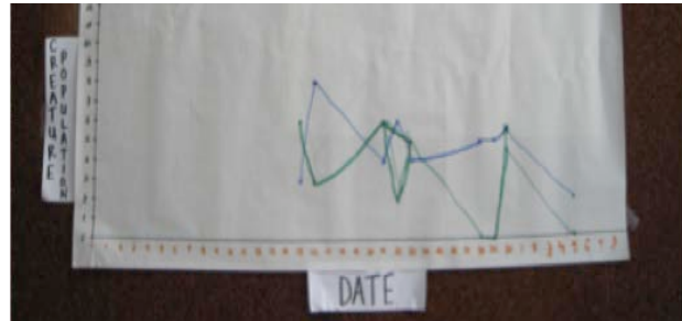
Figure 5. Errors in counting mask important population trends in prior WallCology enactment.

In WallCology, students gather and transcribe substantial amounts of “objective” data involving habitats, life cycle patterns, producer/consumer relationships, and environmental conditions. They “count” individual animals within WallScopes (samples) and computer population estimates based on physical measurements of the classroom walls. Errors in these practices can have significant impacts on the resultant representations used by students to reason about the state of the ecosystem. For example, an incorrect characterization of the life cycle of one species can result in incorrect classification of individuals within sampling activities, leading to population estimation errors. Inconsistent procedures for counting individuals (even if properly classified), or computational errors in determining count averages can have similar effects. In WallCology, the cumulative impact of these errors can easily mask population shifts or introduce representational artifacts unrepresentative of the actual state of the ecosystem.